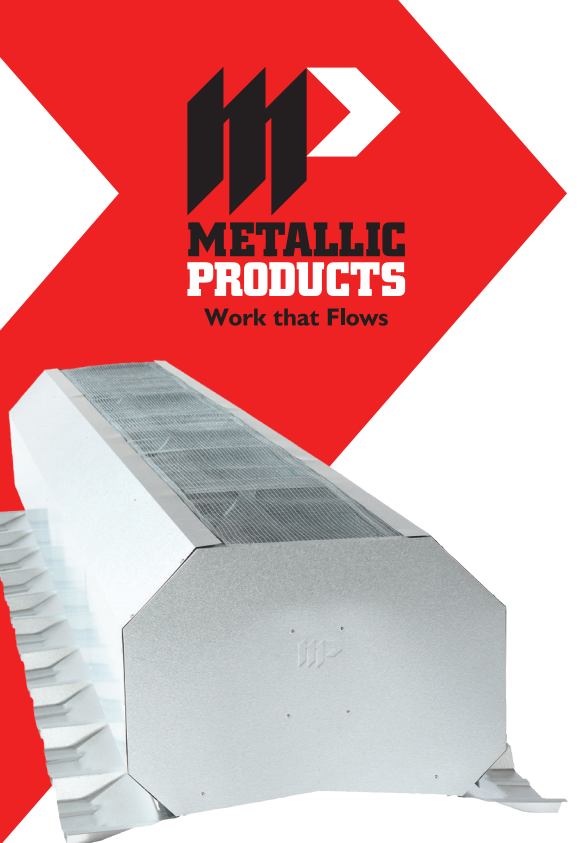
9" and 12" Throat Continuous Ridge Ventilators